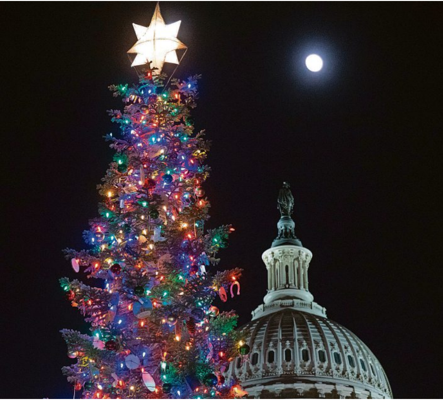
The US Capitol Christmas tree is lit during a lighting ceremony on Capitol Hill in Washington on Dec. 2.