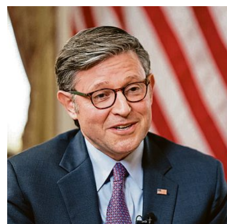
House Speaker Mike Johnson said "there's an expectation" of a more unified government.