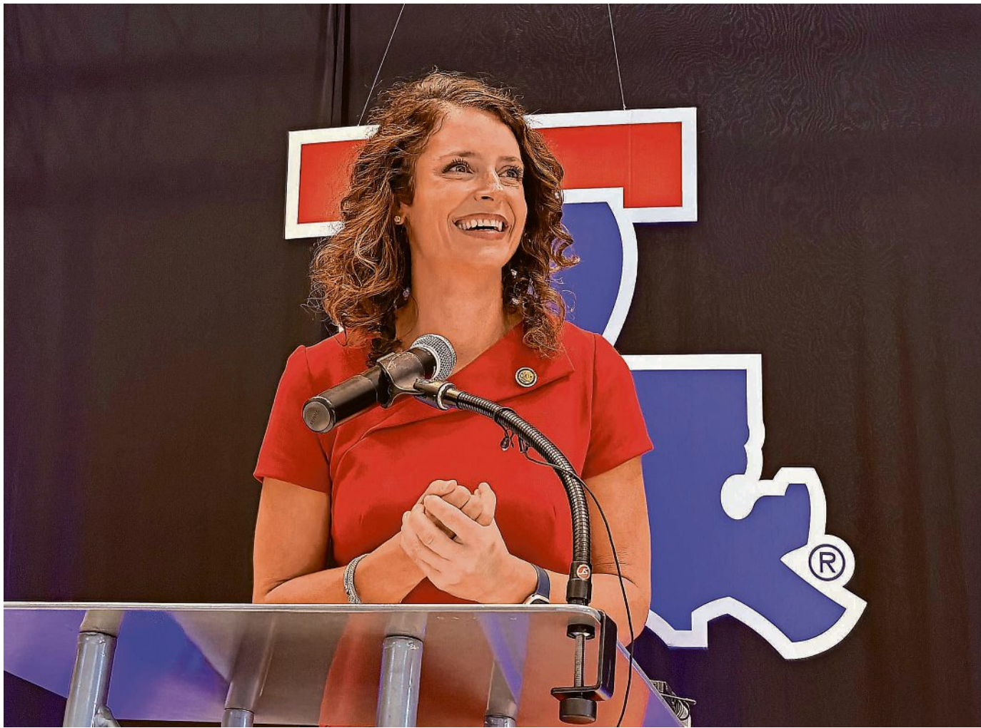
Louisiana Congresswoman Julia Letlow, R-Baton Rouge, speaks to an audience at Louisiana Tech University on Aug. 25.