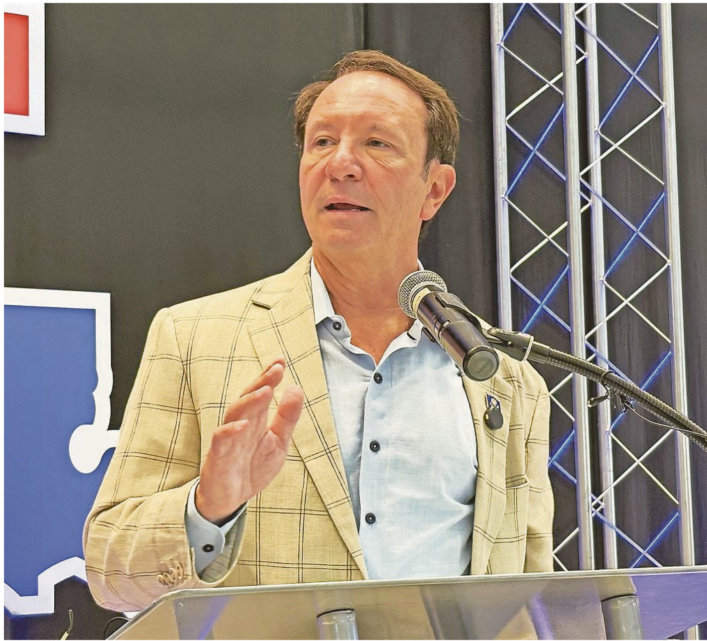
Louisiana Gov. Jeff Landry speaks to an audience at Louisiana Tech University on Aug. 25.

Community members are invited to celebrate the East Regional Library’s 10th Birthday with a family-friendly festival on Saturday, Oct. 18, from 11 a.m. to 3 p.m. See other events in the coming weeks.