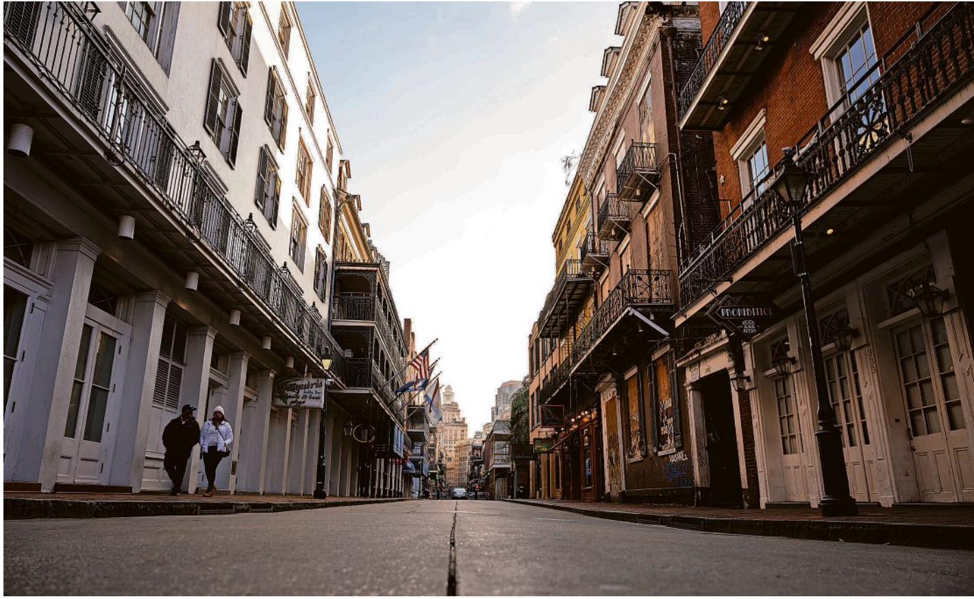
An empty Bourbon Street is seen in the evening in 2021. JON CHERRY/GETTY IMAGES FILE

Presley Bo Tyler Shreveport Times USA TODAY NETWORK