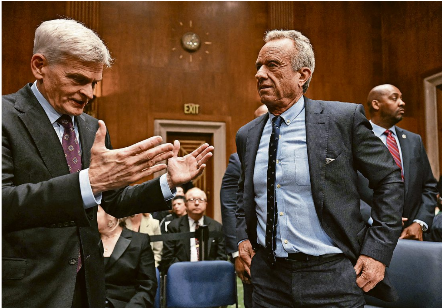
U.S. Secretary of Health and Human Services Robert F. Kennedy Jr., right, speaks with committee chairman Senator Bill Cassidy, Republican from Louisiana, before the start of a Senate Committee on Health, Education, Labor, and Pensions hearing on the President's proposed budget request for fiscal year 2026 for the Department of Health and Human Services, on Capitol Hill in Washington, D.C., May 14.