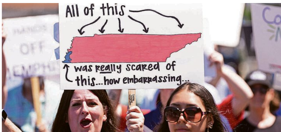
Demonstrators in Memphis take part in a march on May 9 held in response to the Tennessee legislature's redrawing of U.S. House maps.