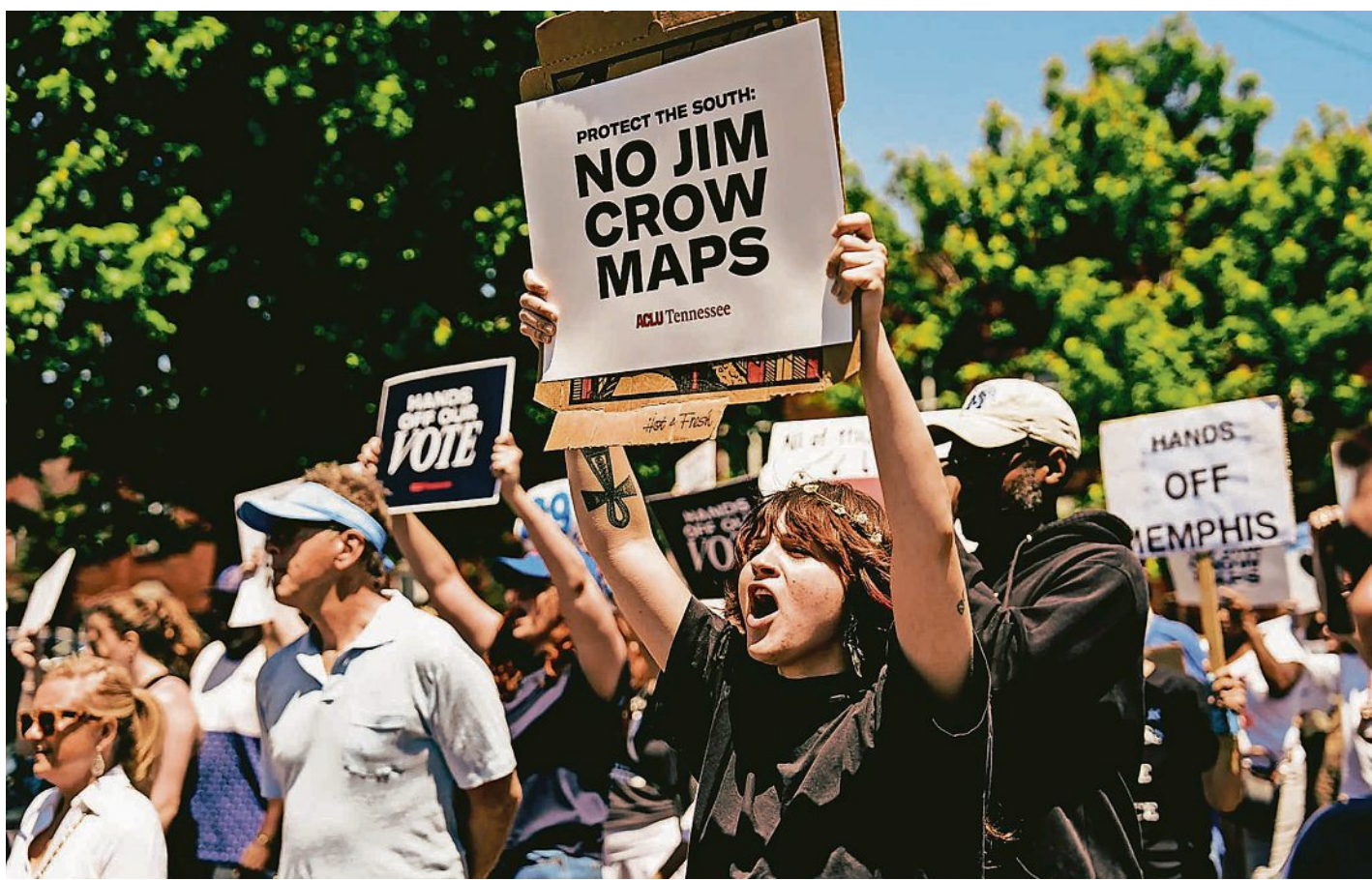
Demonstrators in Memphis take part in a march on May 9 held in response to the Tennessee legislature's redrawing of U.S. House maps.