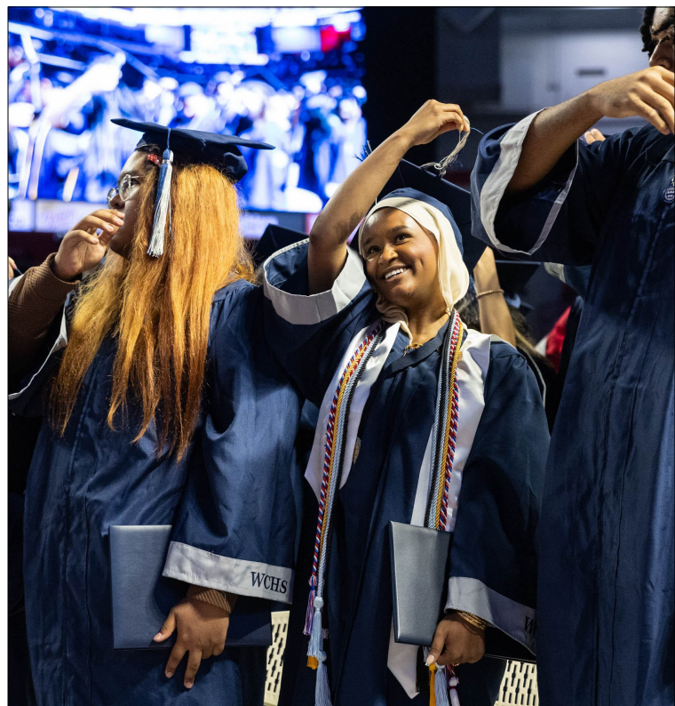
Warren Central High School's 254 graduating seniors move their tassels over at the end of their graduation ceremony at WKU's E. A. Diddle Arena on Saturday, May 16, 2026.