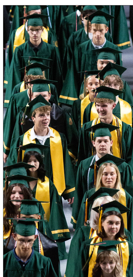
Greenwood High School graduating seniors march into WKU's E.A. Diddle Arena.