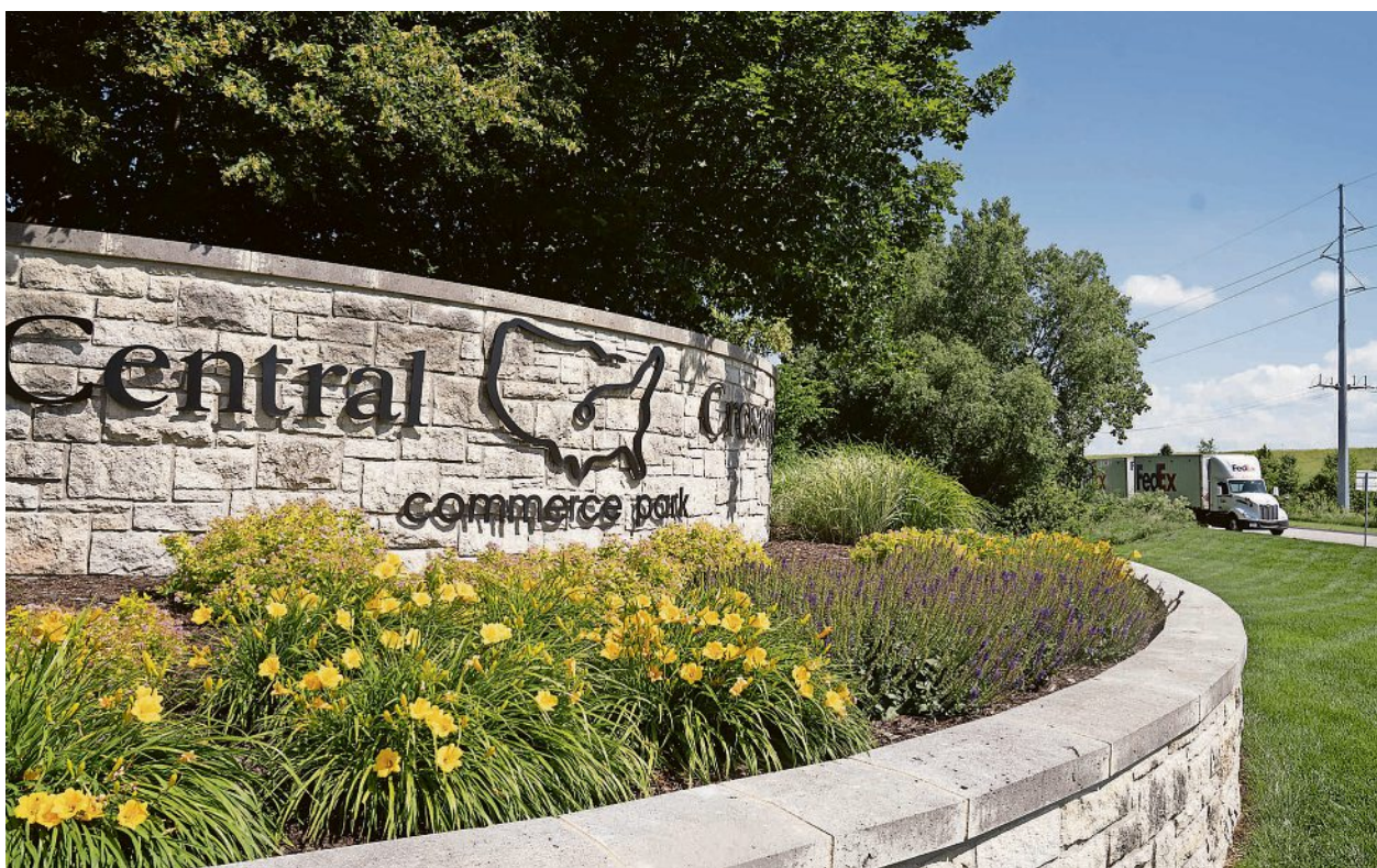
Central Crossing Commerce Park is an industrial park with over 500 acres in South Topeka.