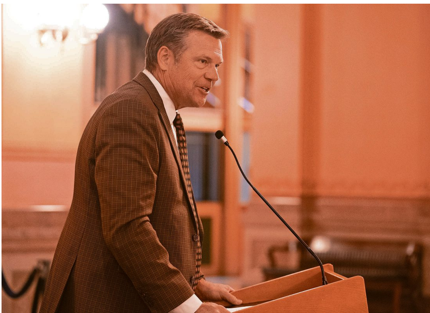
Kansas Attorney General Kris Kobach gives a prayer about protecting liberties granted under the U.S. Constitution and Bill of Rights during a National Day of Prayer event at the Kansas Statehouse on May 7.