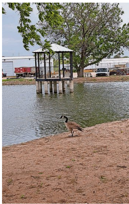
Canada geese have become a problem at Hutchinson Correctional Facility, which is looking for a contractor to help.