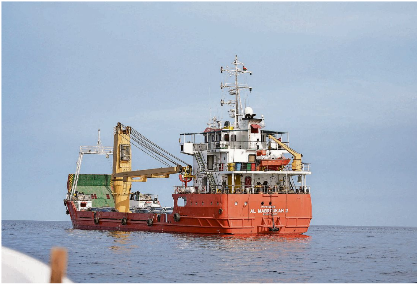
Iran announced on April 17 that the Strait of Hormuz is opened to commercial vessels following a ceasefire agreement between Israel and Lebanon.