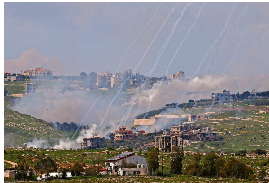
Smoke rises following artillery shelling in Lebanon on April 11. Lebanon and Israel came to a 10-day ceasefire agreement on April 16.