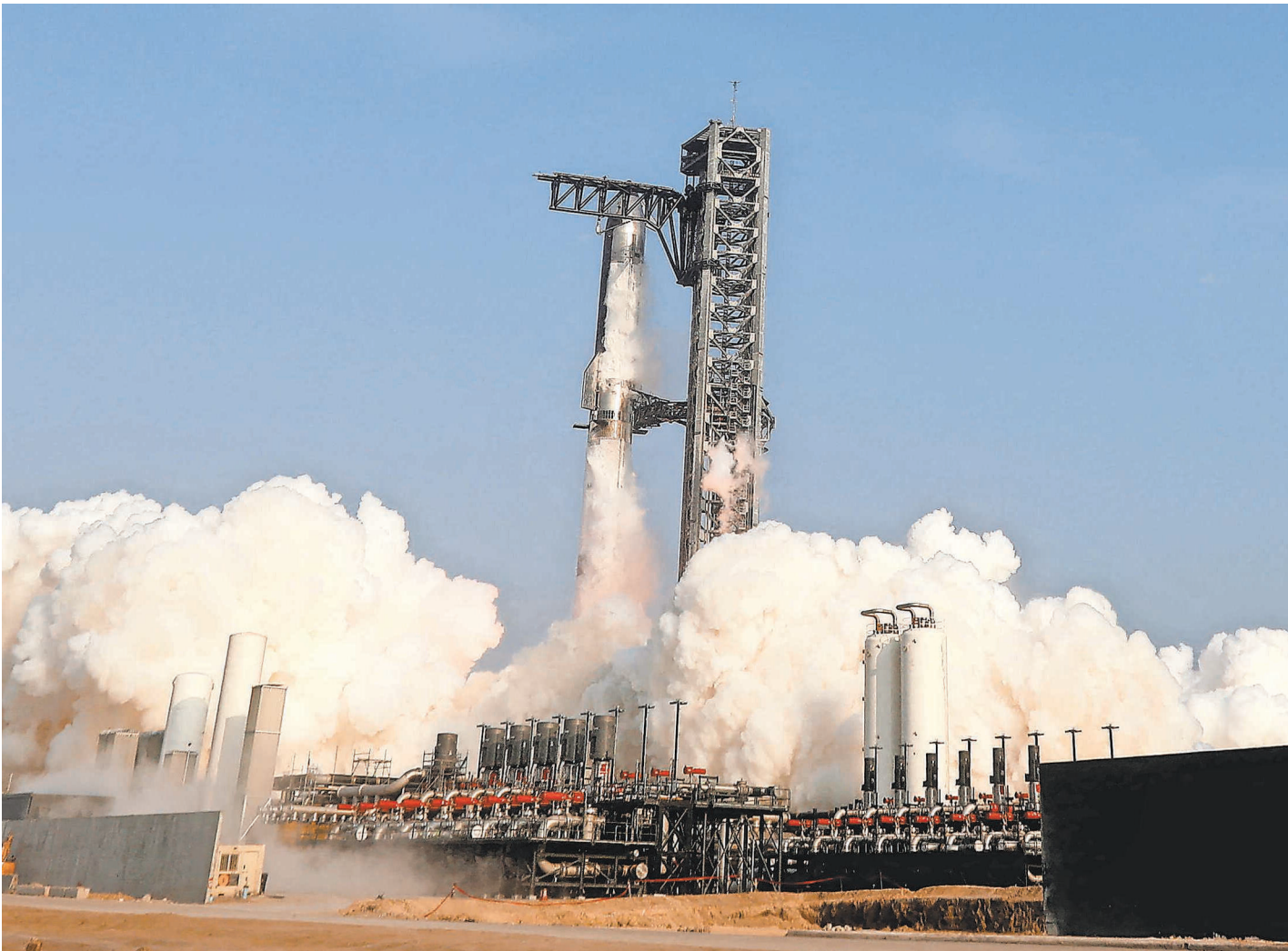
SpaceX’s Starship spacecraft is launched on its ninth test at the company’s launch pad in Starbase, Texas, May 27.