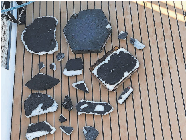
Debris that appears to be heat shield tiles from SpaceX’s Starship was found floating in the water in the Bahamas March 8, two days after Starship exploded during a test flight.