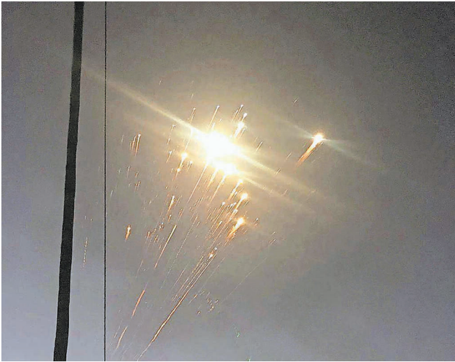
Debris streaks through the sky after SpaceX’s Starship exploded during a test flight in the Bahamas March 6.