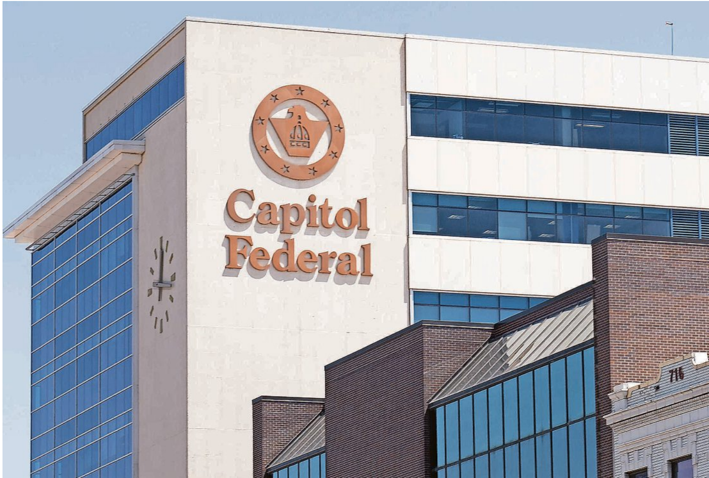
Capitol Federal Savings Bank at 700 S. Kansas Ave.