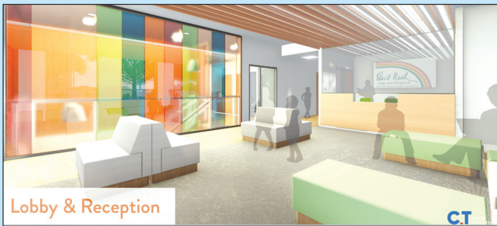
Lobby & Reception

"Many of our families live in Lawrence and the surrounding