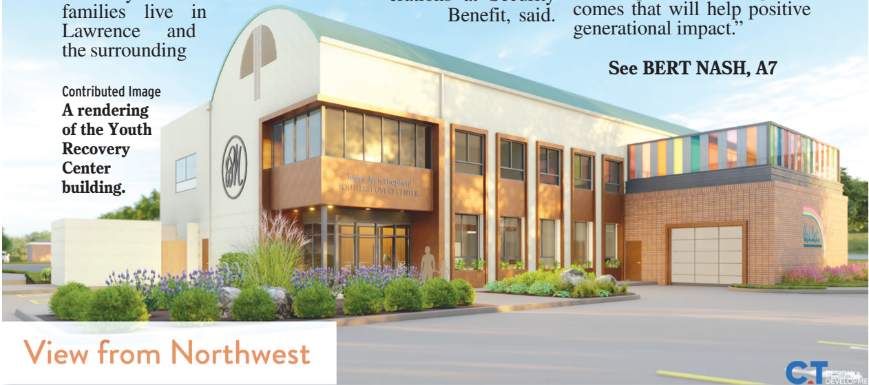
View from Northwest

Contributed Image A rendering of the Youth Recovery Center building.