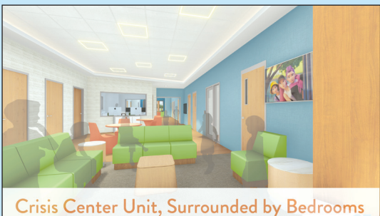
Crisis Center Unit, Surrounded by Bedrooms