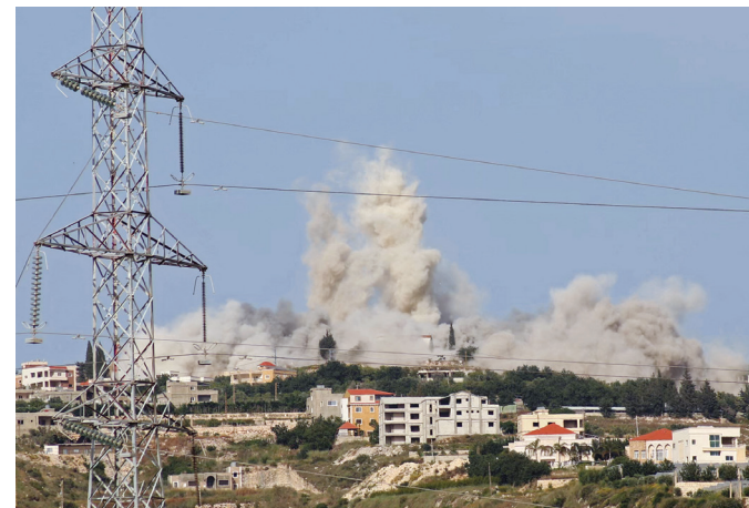
SMOKE RISES from the site of an Israeli airstrike that targeted the southern Lebanese village of Erzay, yesterday.

Why? Because it is not the government of Lebanon that decided to wage war against Israel, first on October 8, 2023, and then again on March 2, 2026. It is Hezbollah, the terrorist organization that owns a commanding stake in the country, and whom the rest of the shareholders either cannot