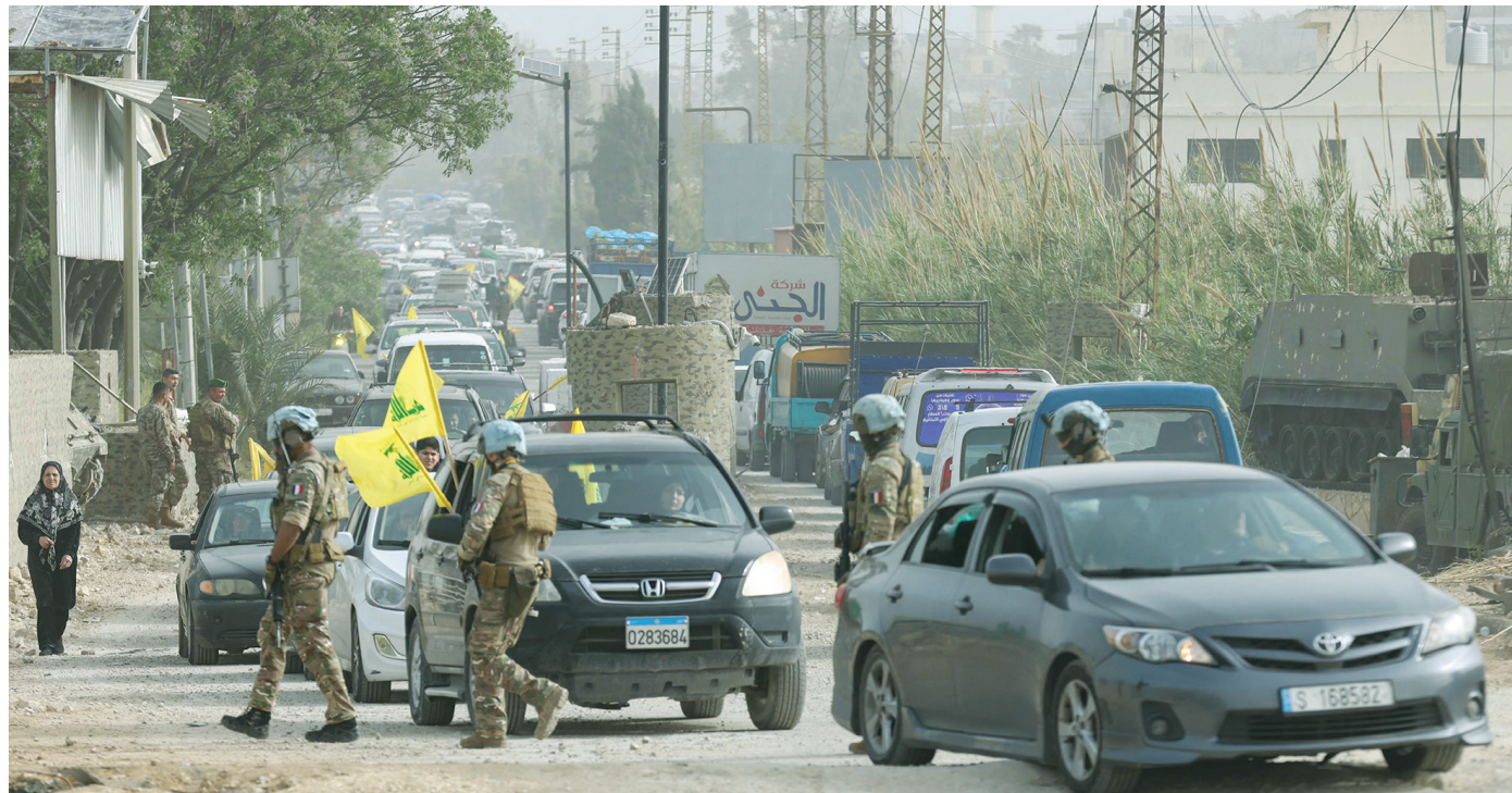
A FRENCH UNIFIL contingent patrols as displaced residents wave Hezbollah flags while they return to their homes in Al-Qasmiyeh, southern Lebanon, yesterday.