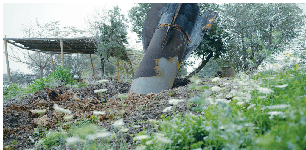
THE TAIL section of a ballistic missile launched from Iran earlier this month landed in Shadmot Mehola in the Jordan Valley.

out massive outside help, would mean Iran lost the chance to produce thousands of missiles it could be manufacturing now and would have produced in