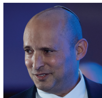
NAFTALI BENNETT

"Israel has no effective public diplomacy, and it's unclear why. When I was prime minister, I established an excellent public diplomacy system. This