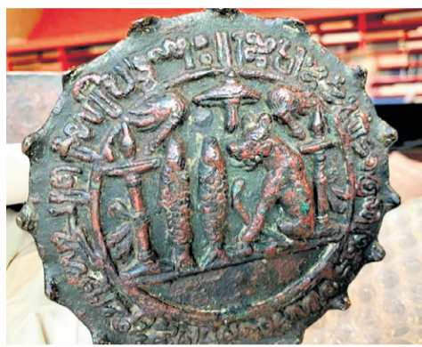
Anaimangalam Chola Copper Plate. The 21 copper plates carry the imprint of two generations of Chola power | x

THE Netherlands on Friday formally returned the 11th-century Anaimangalam Chola Copper Plates to India, marking the culmination of a 14-year diplomatic effort to reclaim one of the most important surviving records of the Chola Empire and a prized symbol of Tamil heritage held overseas. The handover took place in The Hague in the presence of Prime Minister Narendra Modi and his Dutch counterpart Rob Jetten. Known in Europe for centuries as the Leiden Plates, the artefacts date to the reign of Emperor Rajaraja Chola I, the builder of the Brihadeeswara Temple at Thanjavur and among the most powerful rulers in South Asian history.