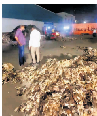
A screengrab of the drug haul at Mundra in Gujarat | x

The Phase II of the initiative, targeted for completion by May 2027, will focus on ensuring the sustainability of the restored water bodies through fencing, strengthening embankments, installing Sewage Treatment Plants, and conducting plantation drives.