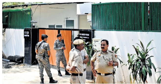
Delhi Police and other security personnel stand guard outside Rajya Sabha MP Sandeep Pathak's residence in New Delhi on Saturday

Security was stepped up outside the Delhi residence of Pathak. In a video on social media he was seen leaving in his car from his Pandara Park residence. A Delhi Police team was stationed at Pathak's residence.