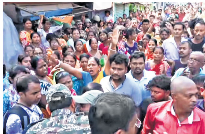
Local residents stage a protest in Falta, South 24-Parganas, on Saturday after being allegedly threatened and assaulted by a TMC leader | P11

West Bengal CM Mamata Banerjee and TMC national general secretary Abhishek Banerjee on Saturday told counting agents of the party that it will secure over 200 of the 294 assembly seats. The agents were asked to apprise them about the situation at all counting centres.