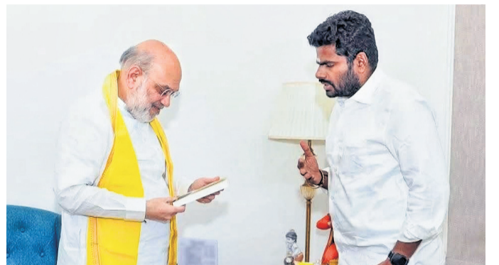
Union home minister Amit Shah with TN BJP leader Annamalai in Delhi | P11

During his meeting with Shah, Annamalai spoke about his prolonged differences with the state unit leadership after being removed as president of the TN unit in 2025 to patch up with the AIADMK.