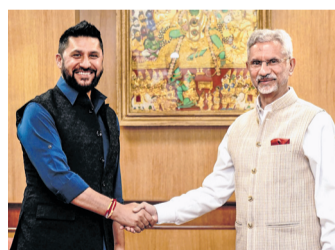
External Affairs Minister S Jaishankar with Nepal's Rastriya Swatantra Party president Rabi Lamichhane in New Delhi Tuesday | P11

The Indian response came amid a deepening political controversy in Nepal, where Shah's comments have triggered protests and repeated disruptions in Parliament. External Affairs Ministry spokesperson Randhir Jaiswal said India had