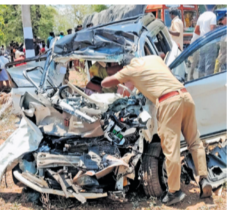
The mangled remains of the car that collided with a lorry on Tuesday