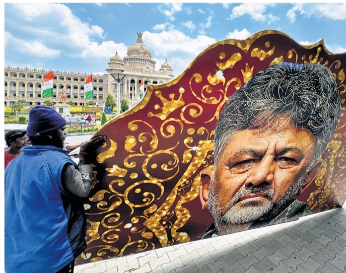
Following Karnataka High Court's order, workers remove posters of D Shivakumar in front of the Vidhana Soudha in Bengaluru on Tuesday, a day before his swearing-in ceremony. The banners had come up after his selection as CM