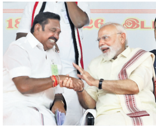
Prime Minister Narendra Modi and AIADMK general secretary Edappadi K Palaniswami during a poll campaign organised at the CODISSIA in Coimbatore