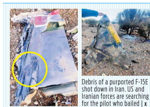
Debris of a purported F-15E shot down in Iran. US and Iranian forces are searching for the pilot who bailed

The downing of the US fighter jet comes on the eve of the UN Security Council voting on a draft resolution proposed by Bahrain on reopening the Strait of Hormuz.