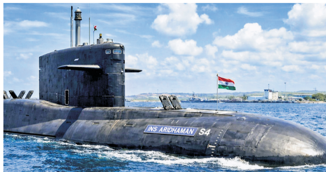
INS Aridhaman ahead of its commissioning ceremony

CHENNAI • MADURAI • VIJAYAWADA • BENGALURU • KOCHI • HYDERABAD • VISAKHAPATNAM • COIMBATORE • KOZHIKODE • THIRUVANANTHAPURAM • BELAGAVI • BHUBANESWAR • SHIVAMOGGA • MANGALURU • TIRUPATI • TIRUCHY • TIRUNELVELI • SAMBALPUR • HUBBALLI • DHARMAPURI • KOTTAYAM • KANNUR • VILLUPURAM • KOLLAM • TADEPALLIGUDEM • NAGAPATTINAM • THRISSUR • KALABURGI