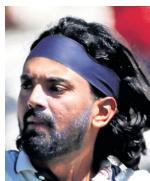
KL Rahul scored a hundred on Saturday

"Buffalo hide is used in India instead of cow. The leather is local and sometimes we use buffalo hides. You know the religious aspect, I think, it is unfortunate because at the end of the day, life is short and what we are using from a cow is a waste product," he told this daily. P13