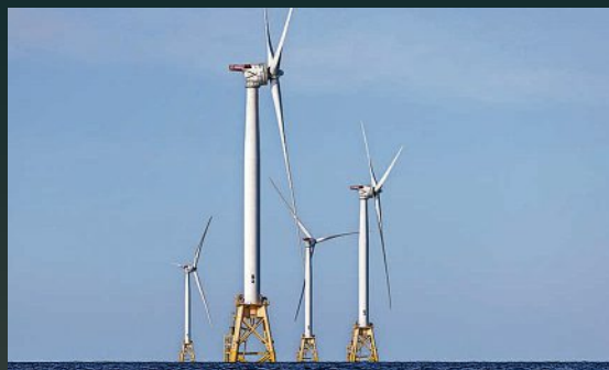
▲ Developing a robust offshore wind industry provides resilience in the face of an unstable global energy market, particularly as future U.S. and global energy demand is projected to grow significantly.