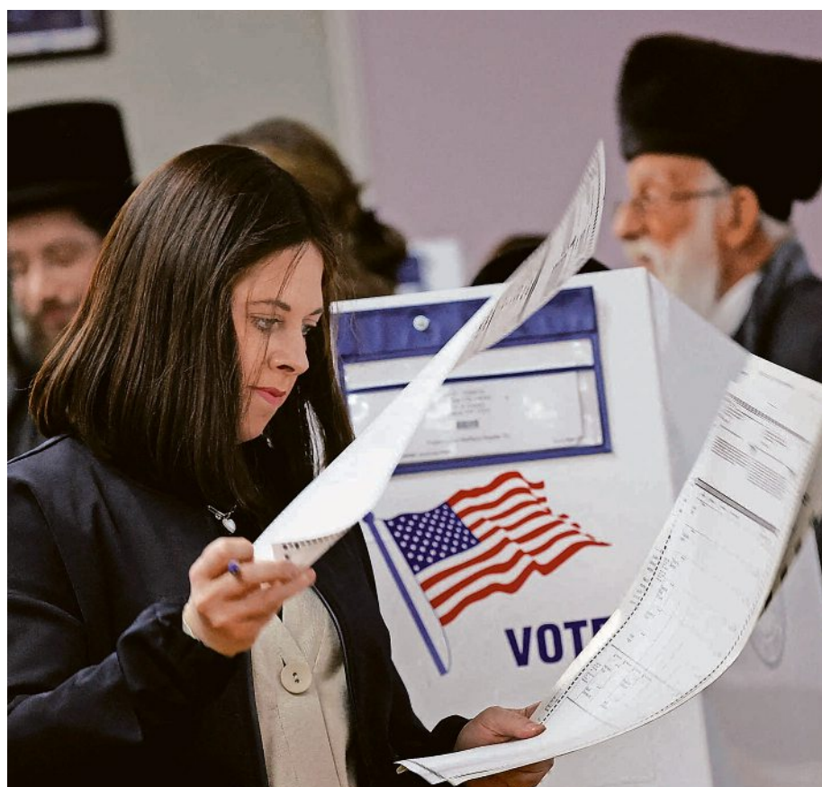
A woman checks over ballot papers at a polling center on Election Day in Brooklyn, New York, on Nov. 5, 2024. Election-security experts broadly support the current combination of technology and paper ballots, which provides a voter-verified trail for post-election audits.