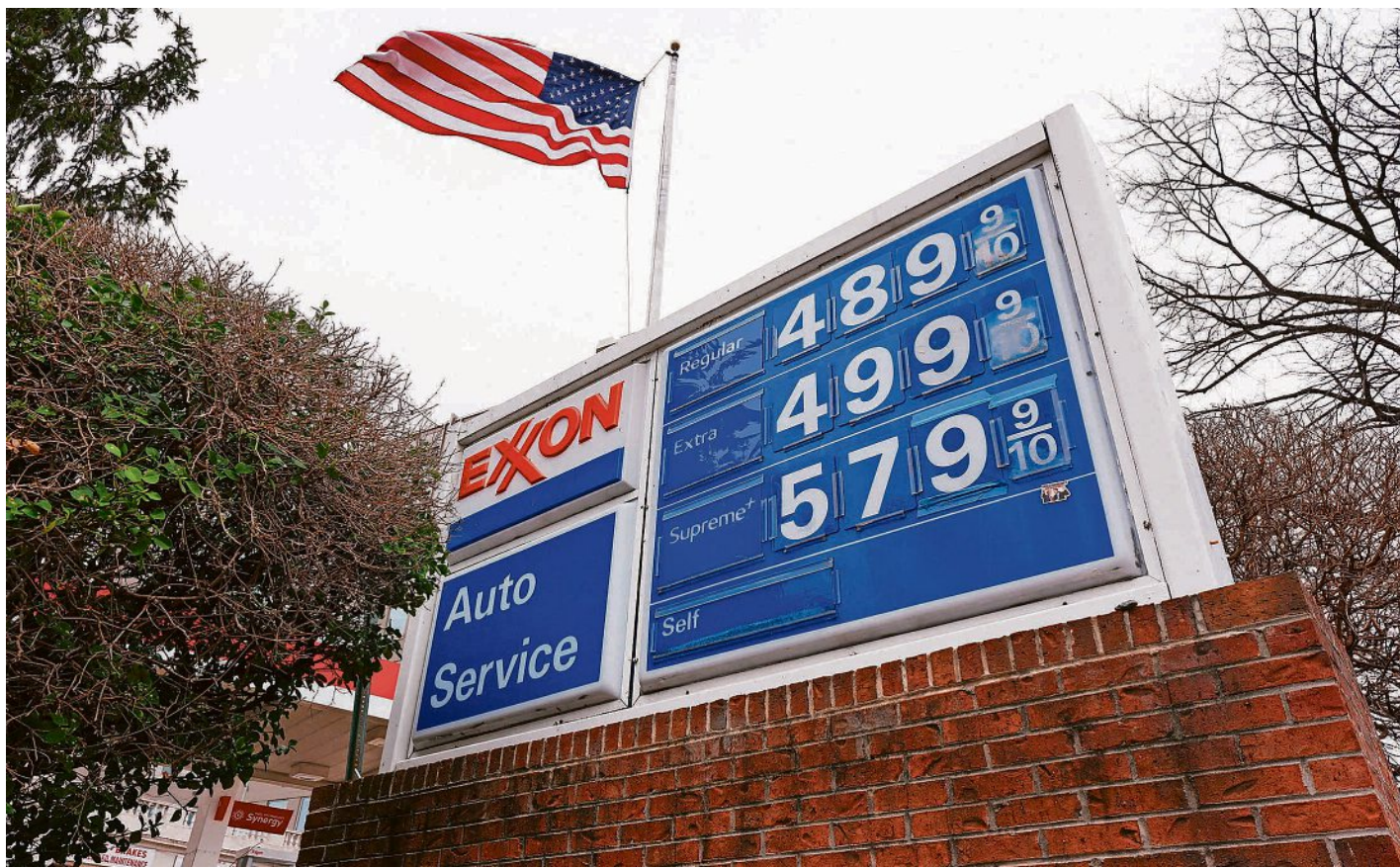
Gas prices are shown in Washington DC, on March 15, amid the U.S.-Israeli war on Iran. Price hikes in gas infuriate Americans more than increases for most other goods, experts say.