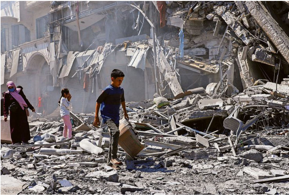
People search through the rubble of a house that was hit by an Israeli air strike in Gaza City, Gaza Strip, on Sept. 12.