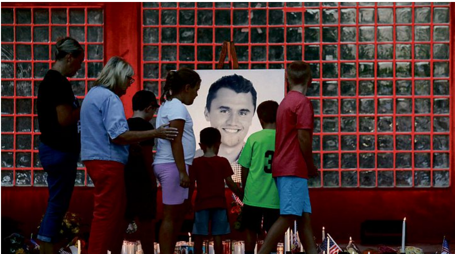
People attend a vigil Sept. 11 for conservative activist Charlie Kirk, an ally of President Donald Trump, who was fatally shot Sept. 10 during an event at Utah Valley University in Orem, Utah.