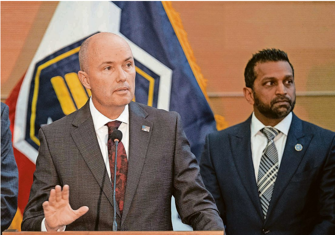
Utah Gov. Spencer Cox, with FBI Director Kash Patel, speaks at a news conference Sept. 12, announcing details on the suspect in the shooting of conservative activist Charlie Kirk two days prior.