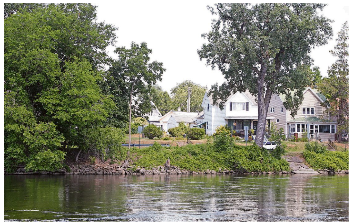
The west side of the St. Joseph River as seen from the East Race boat ramp on July 3 in South Bend. A proposed pedestrian bridge is expected to span the river from the east side to the area seen where East Marion Street and Riverside Drive come together.