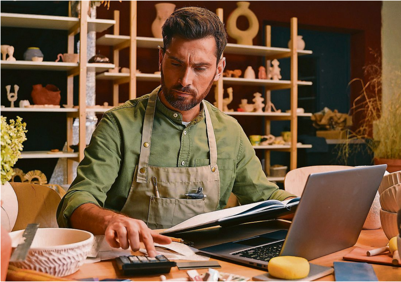
A few commissions, contracts, sales or cancellations can dramatically change what artists earn in a given year.