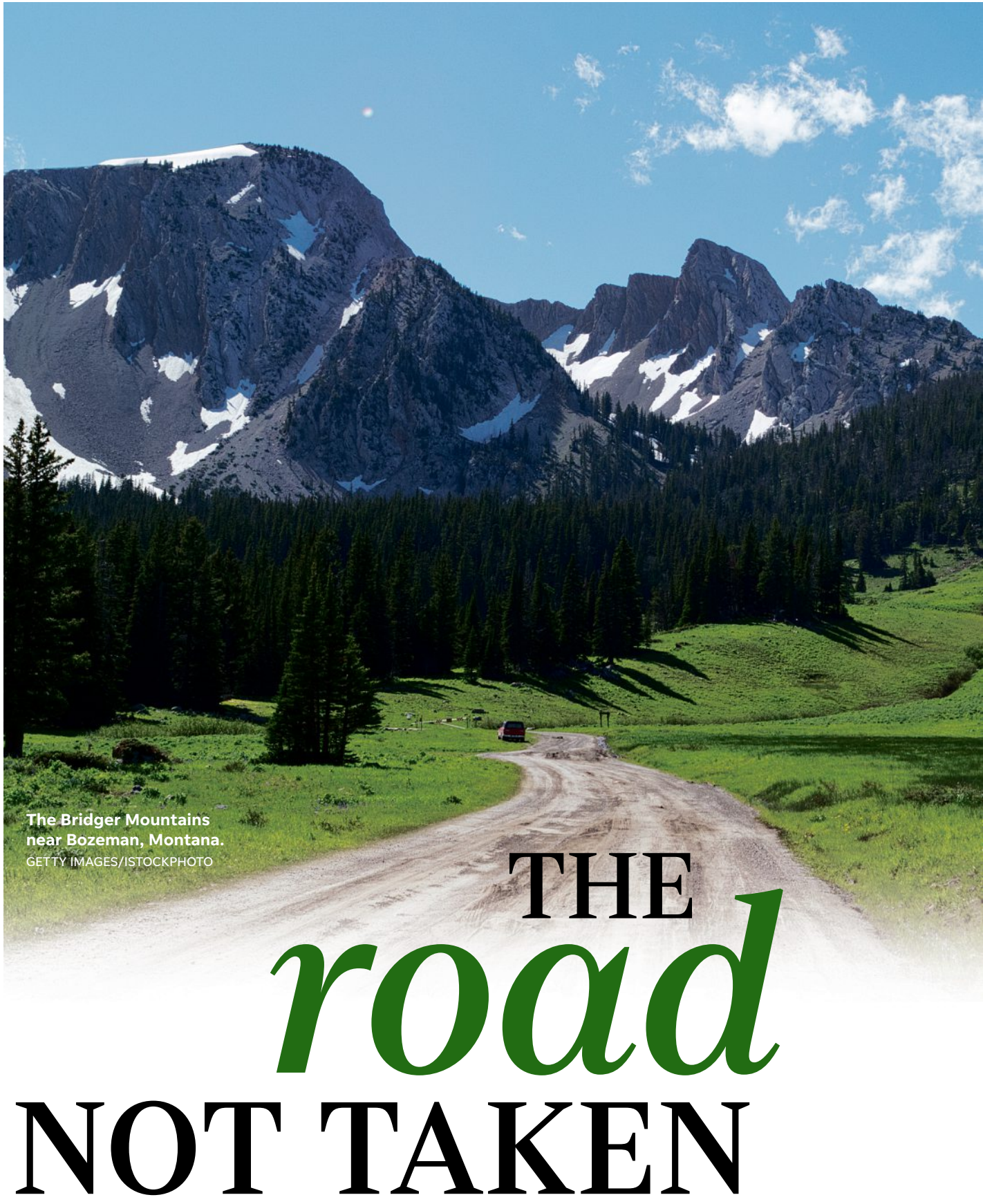
The Bridger Mountains near Bozeman, Montana.

TUESDAY, SEPTEMBER 16, 2025 | RICHMOND, IND. PART OF THE USA TODAY NETWORK