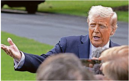
Georgia is the only 2024 swing state where President Donald Trump has a positive approval rating, according to Morning Consult.