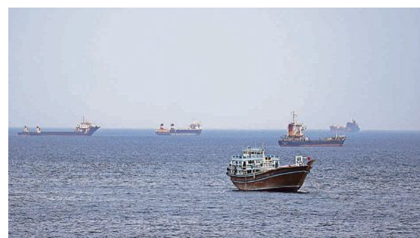
President Donald Trump on April 23 said he ordered the Navy "to shoot and kill any boat" putting mines in the Strait of Hormuz, as he blockades shipping with Iran.