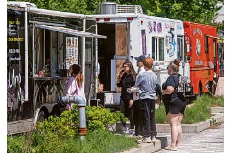
People wait in line at Uno Más during food truck Friday at Switchyard Park on May 10, 2024.