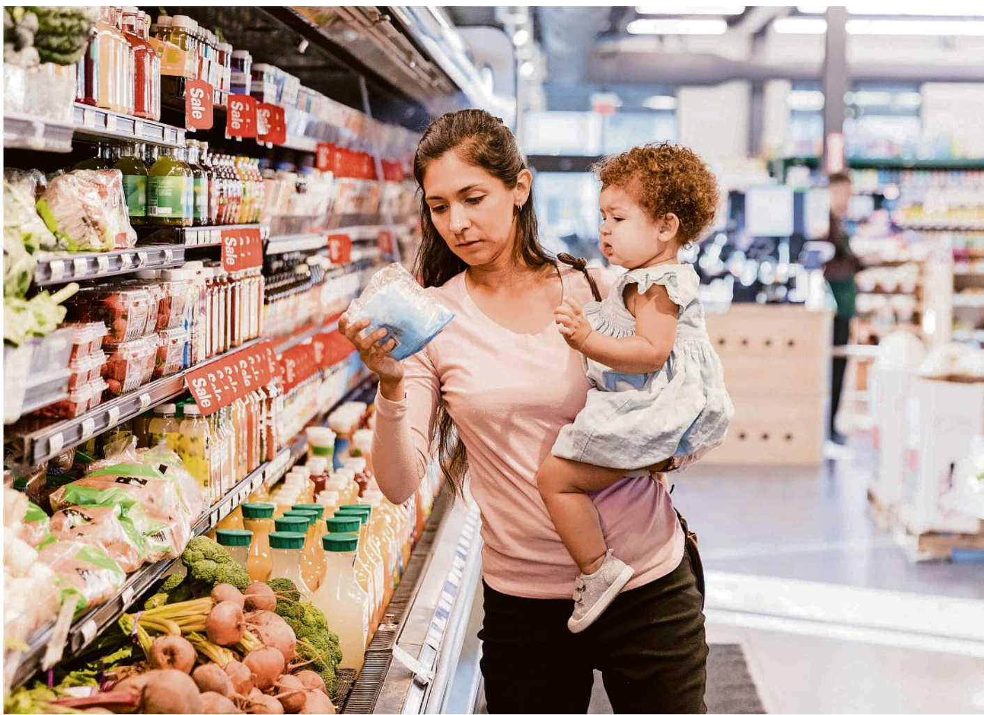
SNAP-Ed taught people how to identify healthy food patterns, keep food safe and navigate a complex food environment. It also taught low-income Americans how to improve their budgeting and planning for meals that balance cost and nutrition.