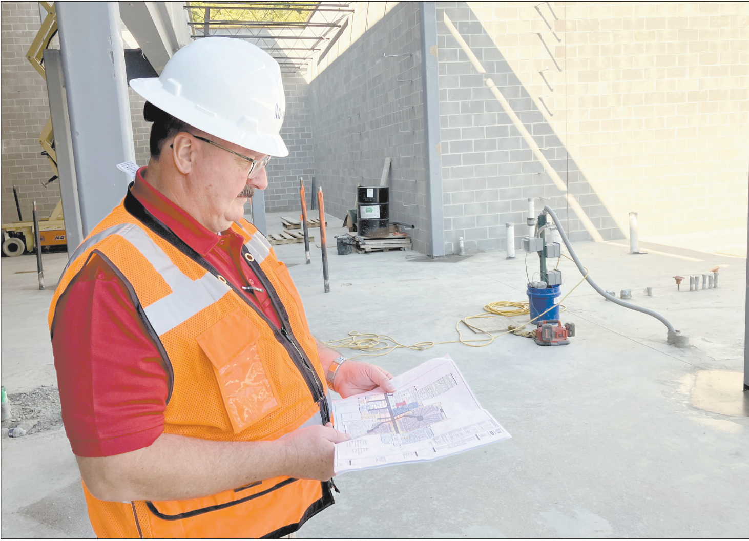
Ken de la Bastide | The Herald Bulletin

Sheriff pleased with progress, expects facility to open near capacity