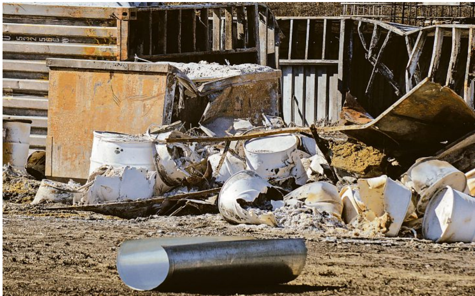
Burned-out barrels and debris are seen near the rear of a PBTT Corp. manufacturing facility in Newburgh, Indiana, on Sept. 7 in the aftermath of what officials said was a large chemical fire.