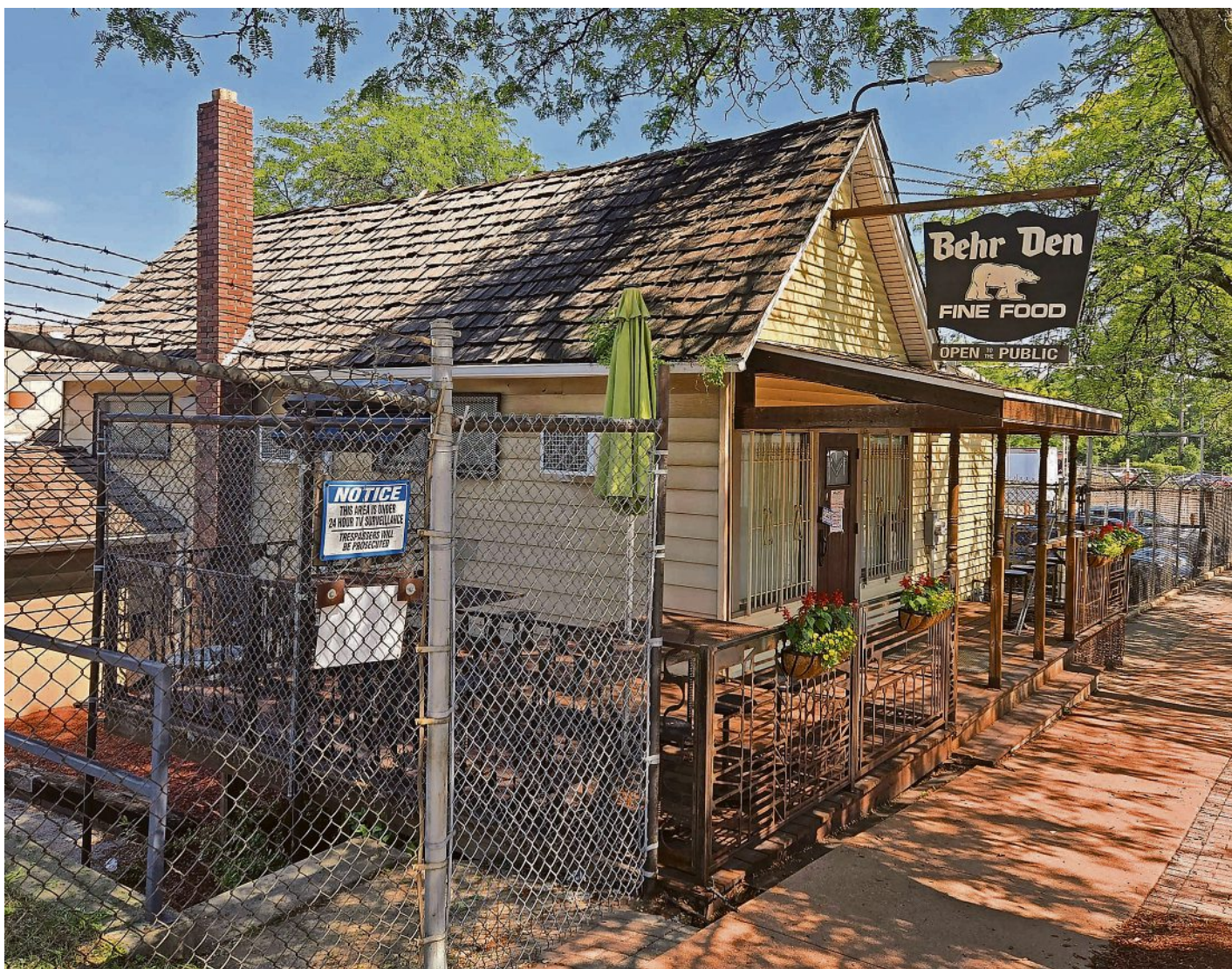
The Behr Den restaurant, 1125 Seminary St., is seen July 7.