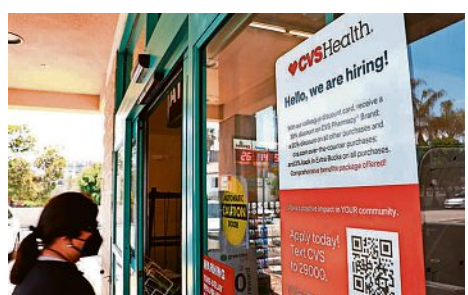
The unemployment rate for recent college graduates ages 22 to 27 stood at 5.7% in the fourth quarter of 2025, up from 5.3% in the previous quarter.