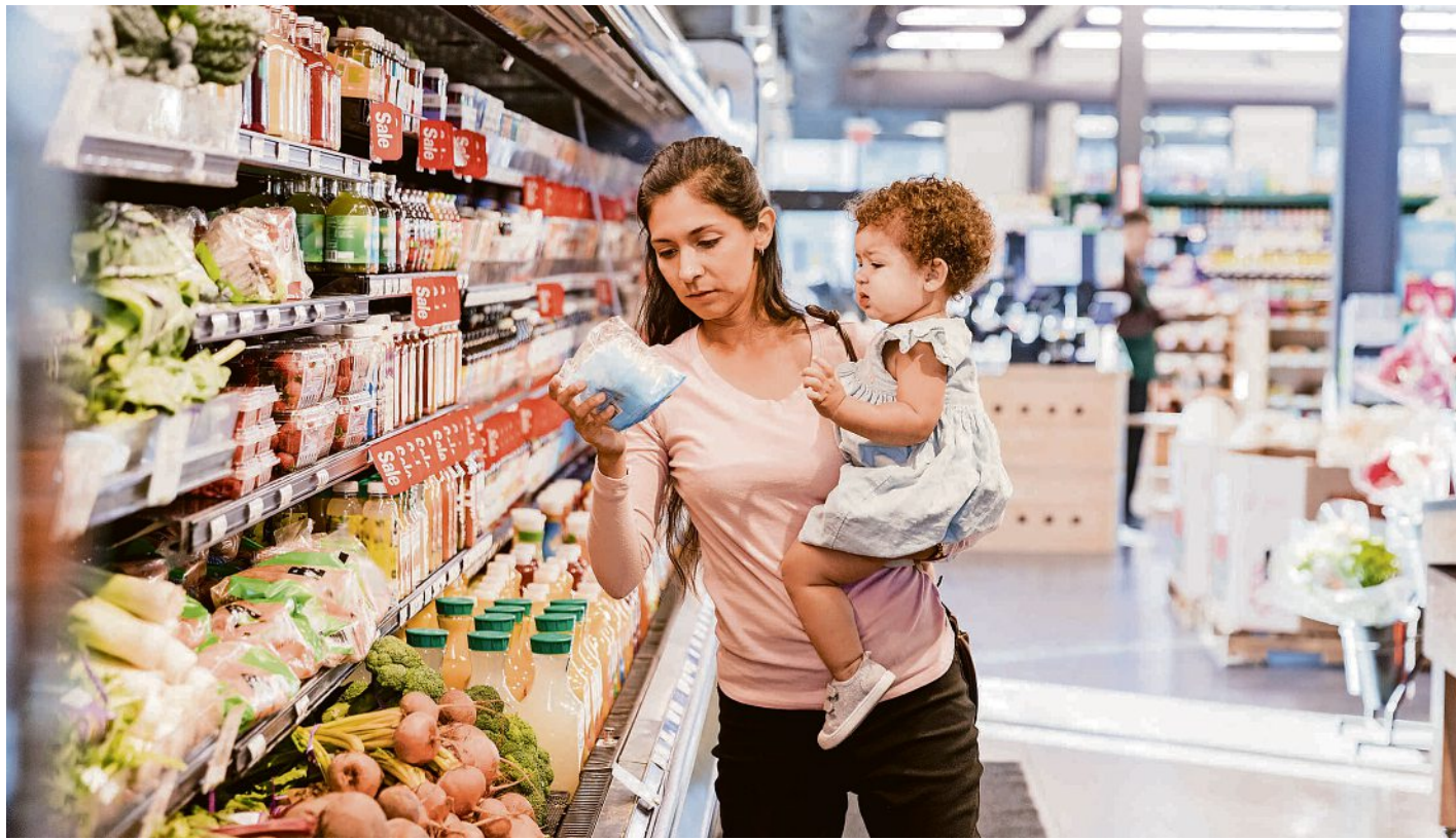
SNAP-Ed taught people how to identify healthy food patterns, keep food safe and navigate a complex food environment. It also taught low-income Americans how to improve their budgeting and planning for meals that balance cost and nutrition.