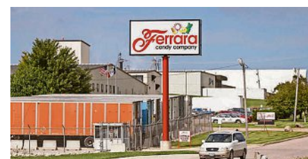
The Creston plant is one of several in the central states that manufacturers products like Brach's Peanut Clusters, Trolli Sour Brite Crawlers and Black Forest fruit snacks for Ferrara Candy Co.