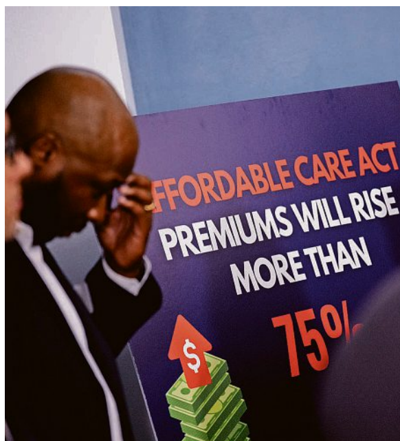
When COVID-19 pandemic era Affordable Care Act subsidies expired on Jan. 1, about 1.4 million people dropped coverage, and for most who didn't, premiums more than doubled.