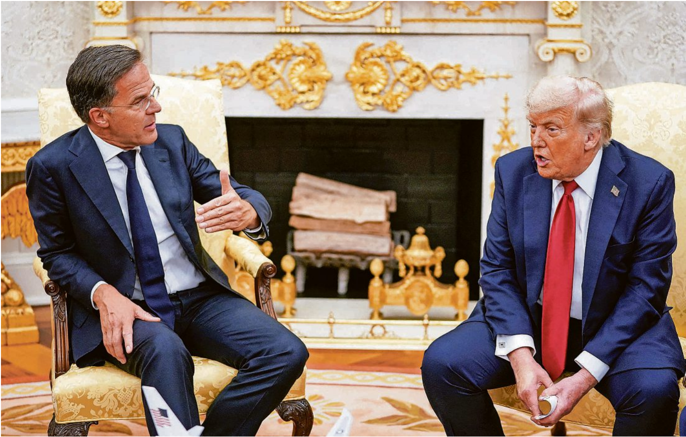
President Donald Trump meets with NATO Secretary General Mark Rutte in July in the Oval Office. One common thread runs through most of Trump’s White House redecoration efforts: a penchant for gold.