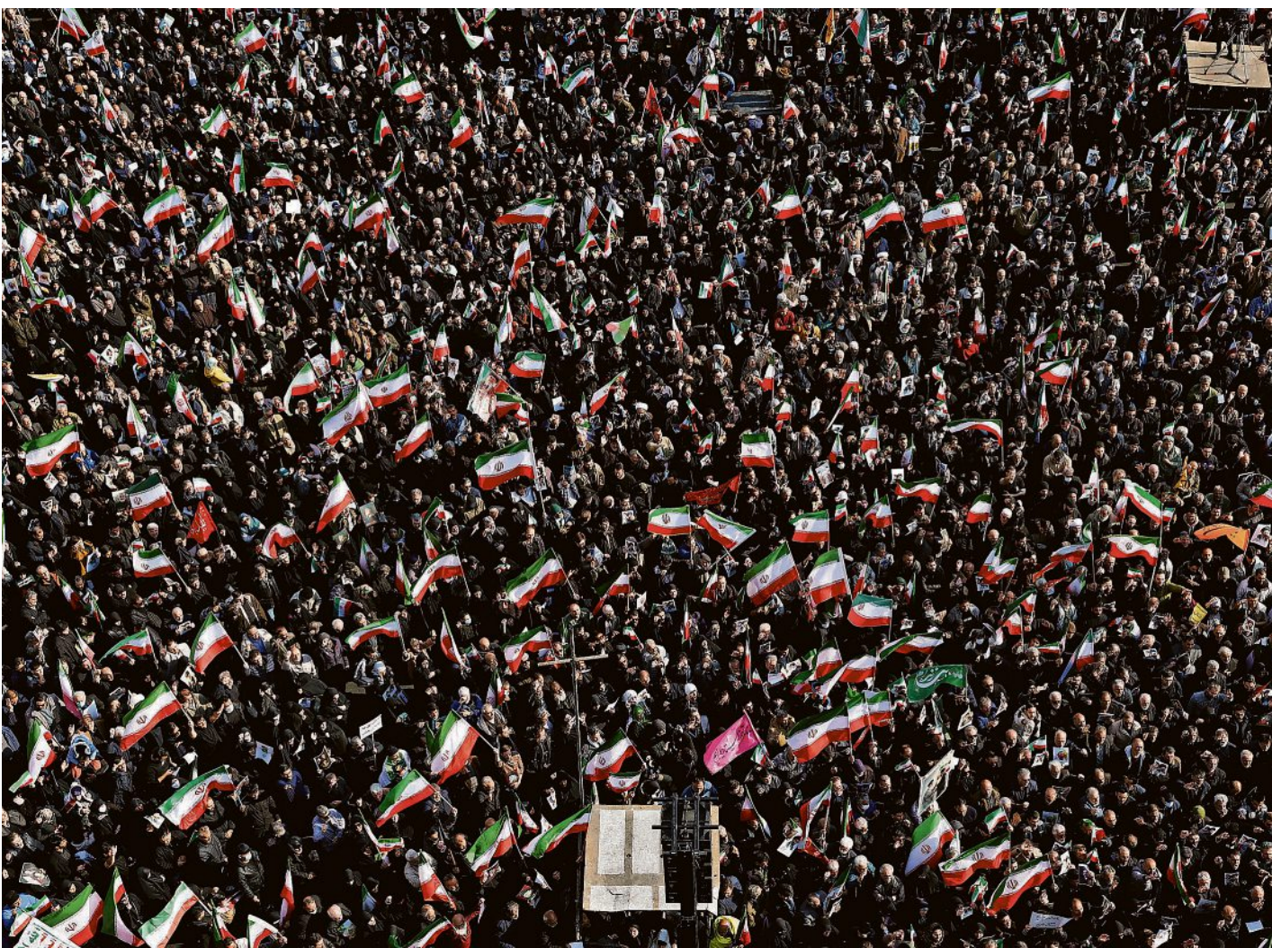
People gather to support Mojtaba Khamenei, Iran's new supreme leader, in Tehran, Iran, on March 9.