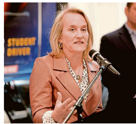
U.S. Rep. Nikki Budzinski, D-Springfield, speaks during a press conference at Lincoln Land Community College April 6, announcing a $76,500 U.S. Department of Transportation grant.