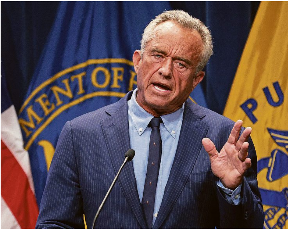
Health and Human Services Secretary Robert F. Kennedy Jr. has promised to announce health policy changes in September "that will dramatically impact the effects" related to autism.