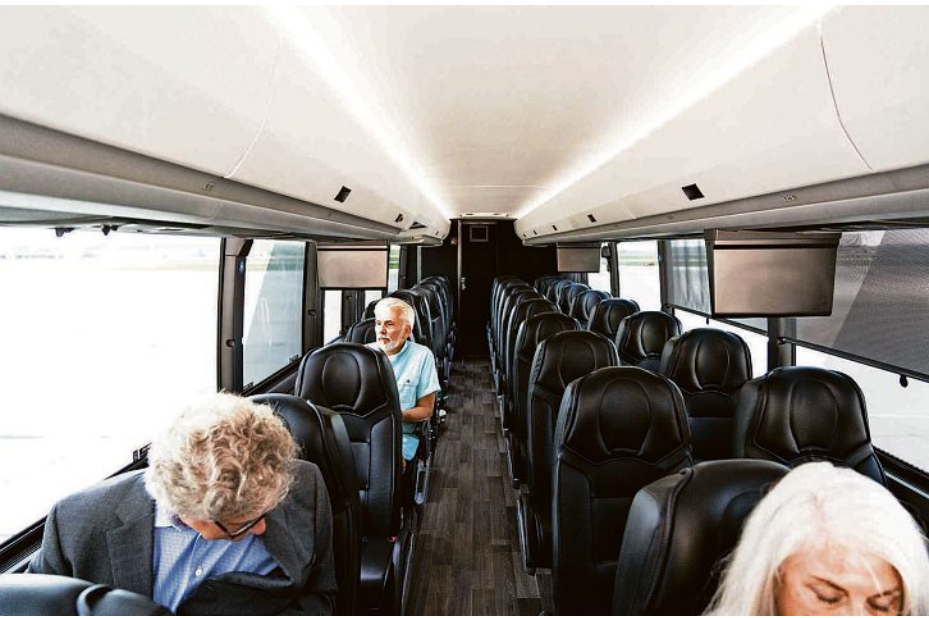
The inside of the new American Airlines Landline coach is pictured Sept. 23 at the Chicago Rockford International Airport.