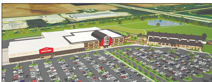
This rendering shows, from left, Rural King's Flagship store, relocating from the Cross County Mall, the new Rural King Store Support Center, and the Rural King Event Center which will be available to the community to host events up to 1,500 attendees.