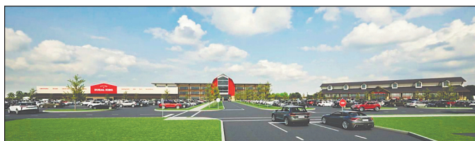
This rendering shows, from left, Rural King's Flagship store, relocating from the Cross County Mall, the new Rural King Store Support Center, and the Rural King Event Center which will be available to the community to host events up to 1,500 attendees.

The event center will be designed to host company meetings, educational training sessions and events. In addition to supporting Rural King, the facility will be available for community use and will accommodate a wide variety of events, including conferences, trade shows, concerts and other gatherings, with a maximum capacity of about