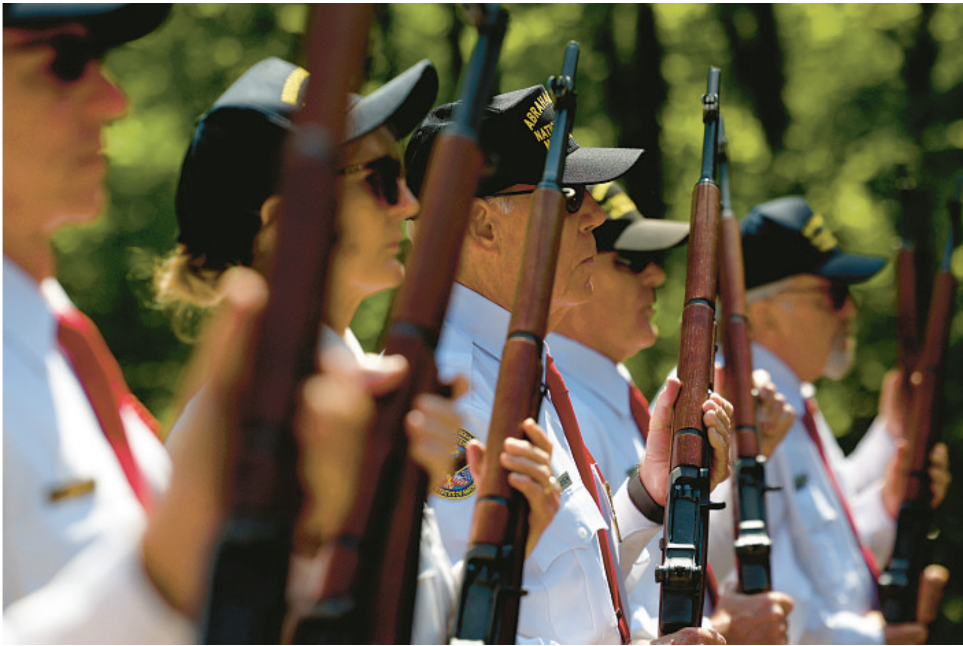
Abraham Lincoln Memorial Squad members prepare to perform a three-volley salute as they honor veterans during funeral services Thursday at Abraham Lincoln National Cemetery in Elwood.