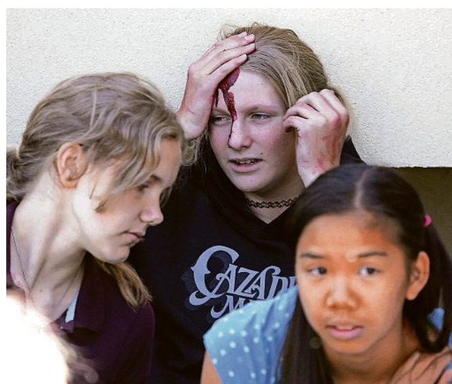
Volunteer students wearing makeup to simulate injuries participate in a school shooting and mass evacuation drill at Lincoln Middle School in Alameda, California. So far, the available research shows mixed evidence on whether shooting drills help students feel more prepared or scare them.