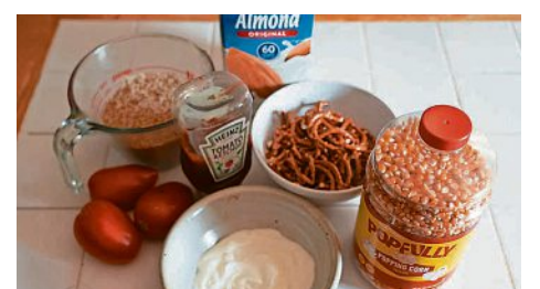
No one should feel bad about having a hard time identifying what an ultra-processed food is, because there is no clear definition.