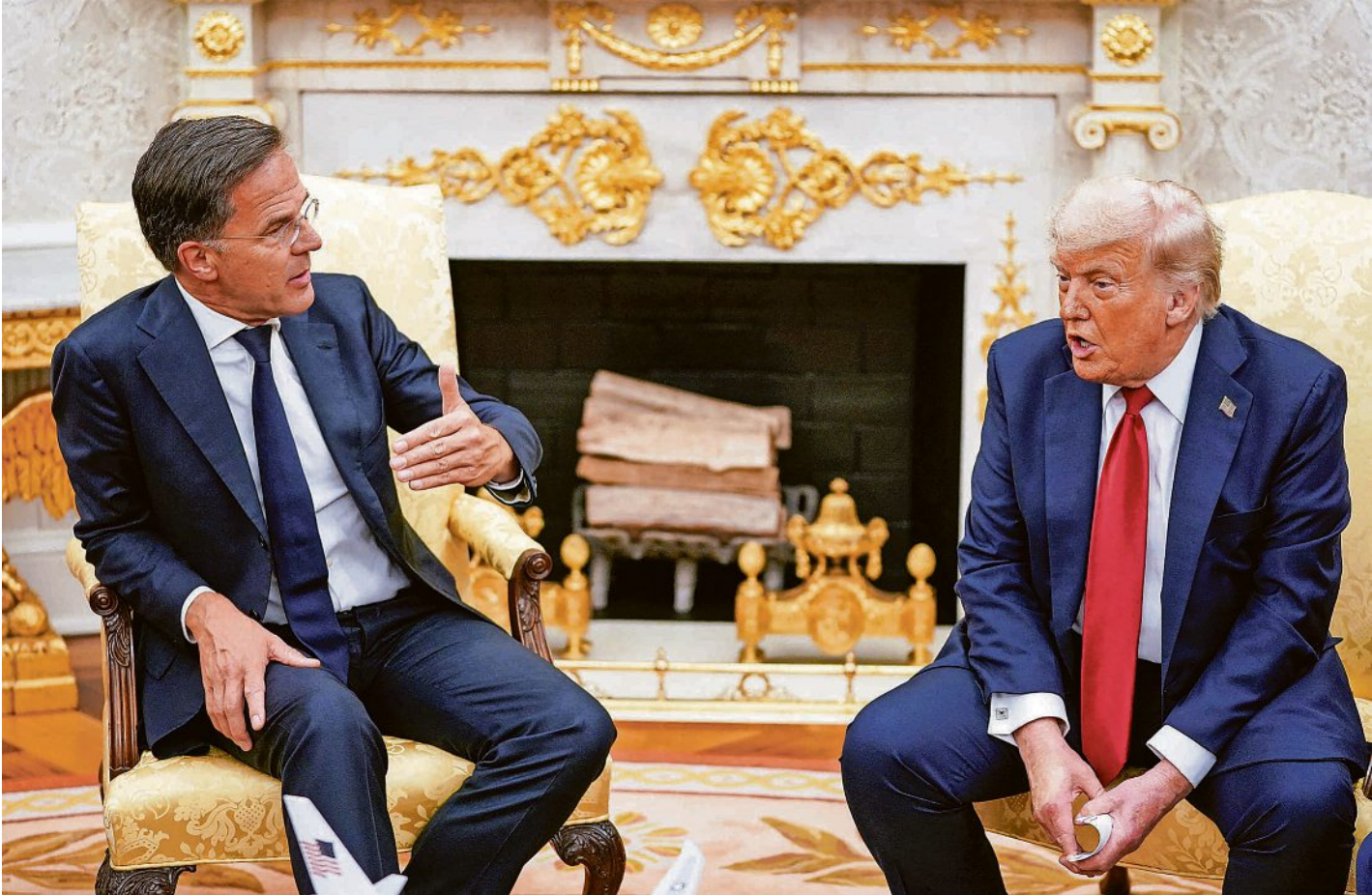
President Donald Trump meets with NATO Secretary General Mark Rutte in July in the Oval Office. One common thread runs through most of Trump’s White House redecoration efforts: a penchant for gold.