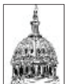
2026 Idaho Legislature

The bill revises House Bill 352, which was itself an addition to the 2024 Parental Rights Act that brought a slew of parental consent requirements for issues ranging from medical care received at schools to interactions with