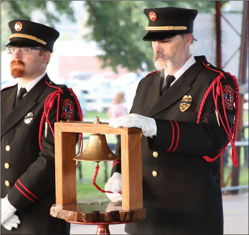
A Boundary County first responder rings a bell in honor of those lost on Sept. 11, 2001, in a community tribute on Thursday, Sept. 11.