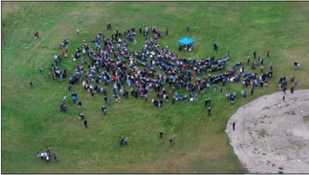
Residents gather at the Boundary County Fairgrounds in a memorial for slain conservative activist Charlie Kirk on Sunday.

On Sunday, Sept. 14, Bonners Ferry held an emotional remembrance for the life of Charlie Kirk. Several hundred Boundary County residents attended the memorial at the Boundary County fairgrounds, peacefully commemorating Charlie Kirk, a man who believed in free speech and a better life for Americans. He was killed on July 10 and is survived by his wife and two children. Going well into the night with a powerful vigil, there were several